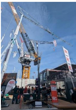
BKL at Bauma 2022. New cranes and the BKL film prove to be a crowd puller.