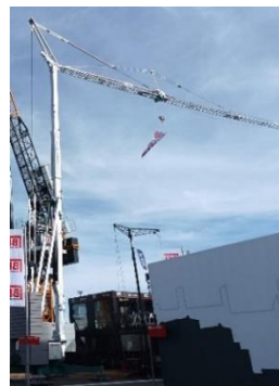
Self-erecting crane CM 350. Industry 4.0-ready 35-metre bottom-slewing crane with eco mode.