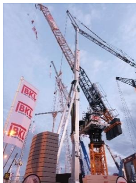
BKL at 2022. The crane specialists celebrate their 15th bauma anniversary.